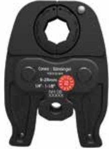
Mother jaw with interchangeable insert