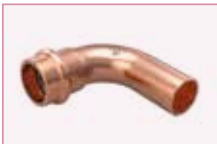
90° Street Bend 3/8" to 1.1/8"