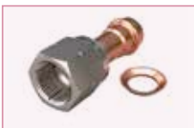
SAE45 Stainless Flare - Stainless Nut - Copper Washer 1/4" x 1/4" to 3/4" x 3/4"