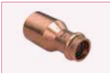
Fitting Reducer 3/8" x 1/4" to 1.1/8" x 7/8"