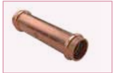
Long Repair Coupler 1/4" to 1.1/8"