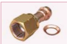
SAE45 Stainless Flare - Brass Nut - Copper Washer 1/4" x 1/4" to 3/4" x 3/4"