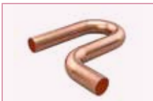
P-Trap 5/8" to 1 1/8" Note: Not UL approved.