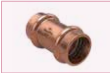
Straight Coupler 1/4" to 1.1/8"