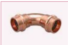
90° Bend 1/4" to 1.1/8"