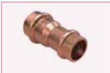
Reducing Coupler 3/8" x 1/4" to 1.1/8" x 1"