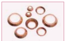
Copper Flare Washer 1/4" to 3/4"