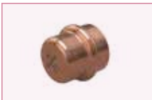
Stop End 1/4" to 1.1/8"