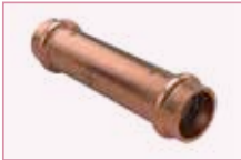
Long Coupler 1/4" to 1.1/8"