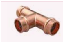
Equal Tee 1/4" to 1.1/8"